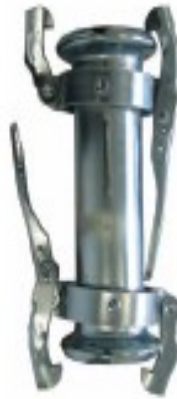
Female-female reversing coupling Type:KDMT..