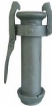
Female-male reversing coupling Type:KGMV..