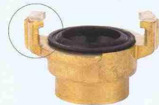
Not deformed 'GK'-claws